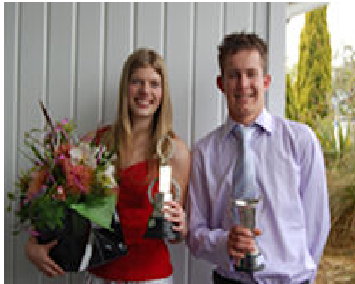
2008 Dux and Proxime Accessit

We hope that parents will give their full support to staff in upholding these standards.