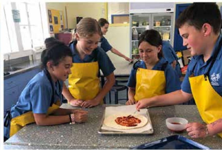
Yr 7 & 8 Ngapuhi team