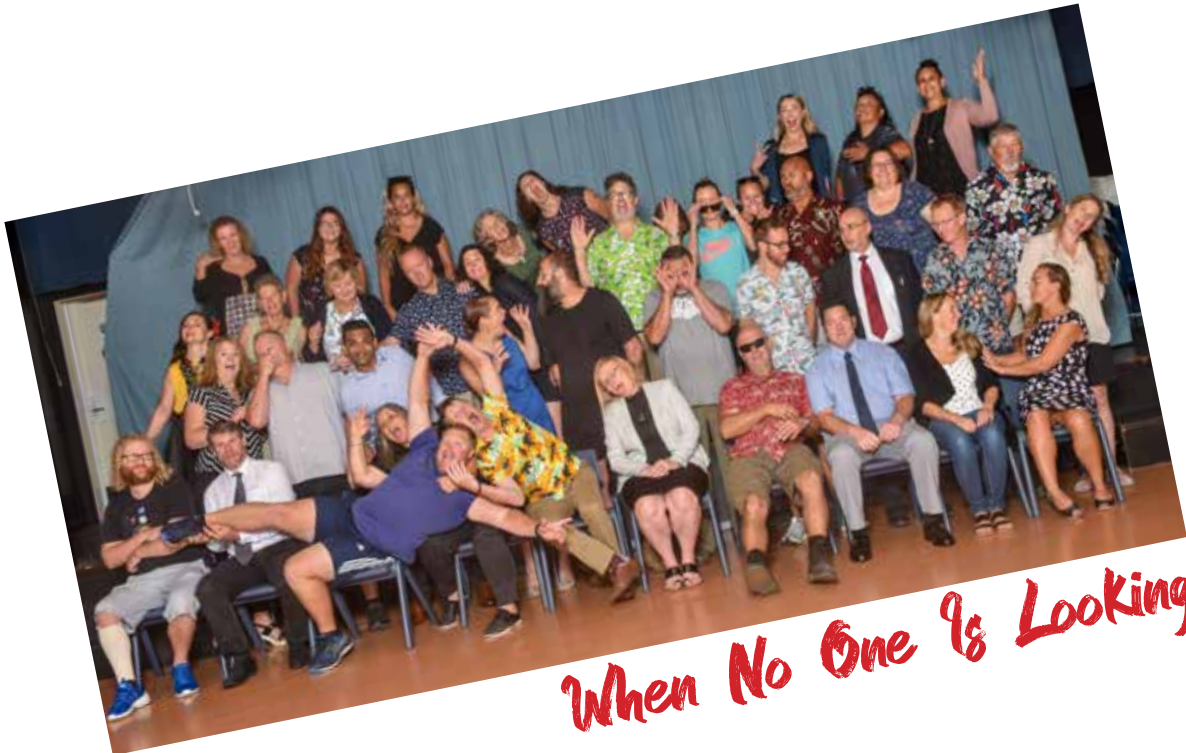
When No One Is Looking