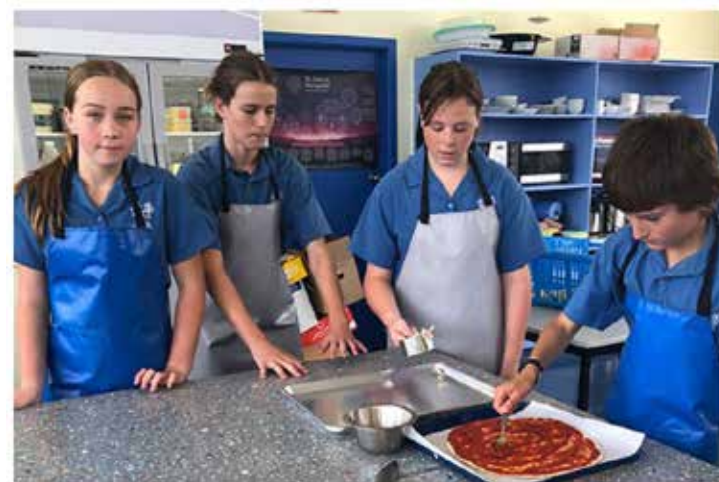
Yr 7 & 8 Maniapoto team

The overall all results are Whatua on an awesome score of 94.375, Ngapuhi on 93.125, Maniapoto on 91.875 and Arawa on 88.8.