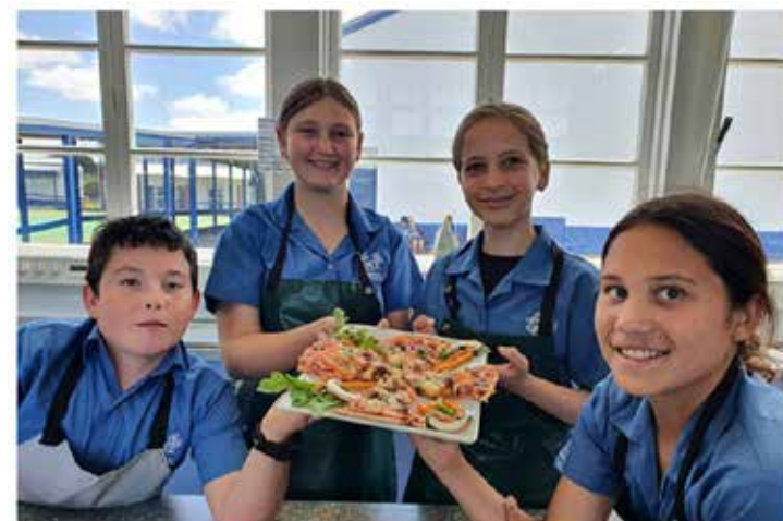
Yr 7 & 8 Arawa