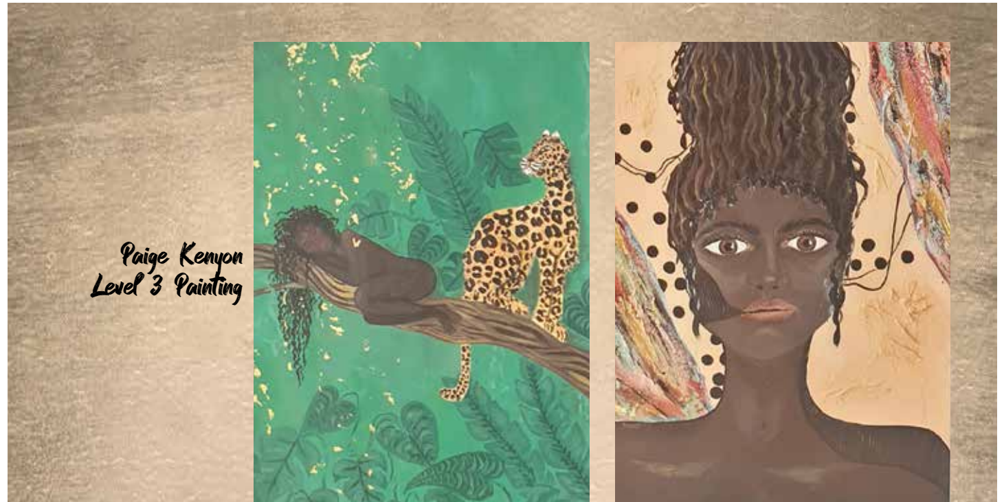
Paige Kenyon Level 3 Painting