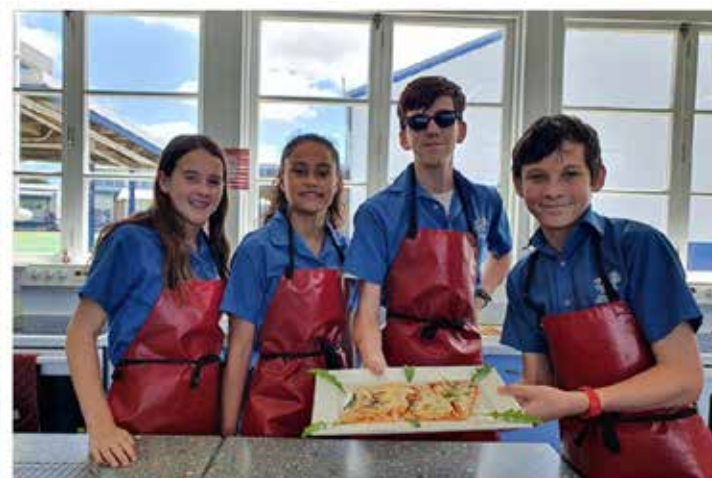
Yr 7 & 8 Whatua team