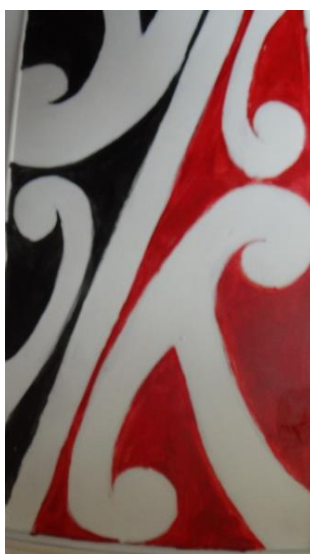
Kowhaiwhai Panel by Rubin